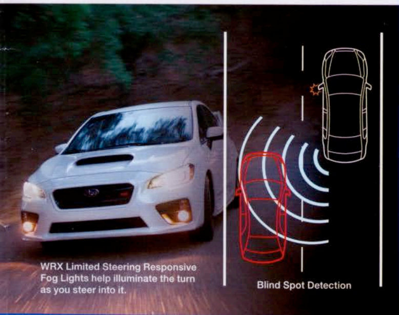
WRX Limited Steering Responsive Fog Lights help illuminate the turn as you steer into it.

As a late-night TV infomercial announcer might say, "But wait, there's more."