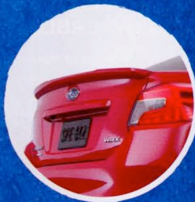
Blind Spot Detection

Go Big or Go Low In addition to its new STARLINK Connected Services, the WRX STI brings news of its own for 2016. Its big rear wing may be iconic, but it can draw more attention than some drivers like. If that's you, get the new low-profile spoiler instead. No charge.